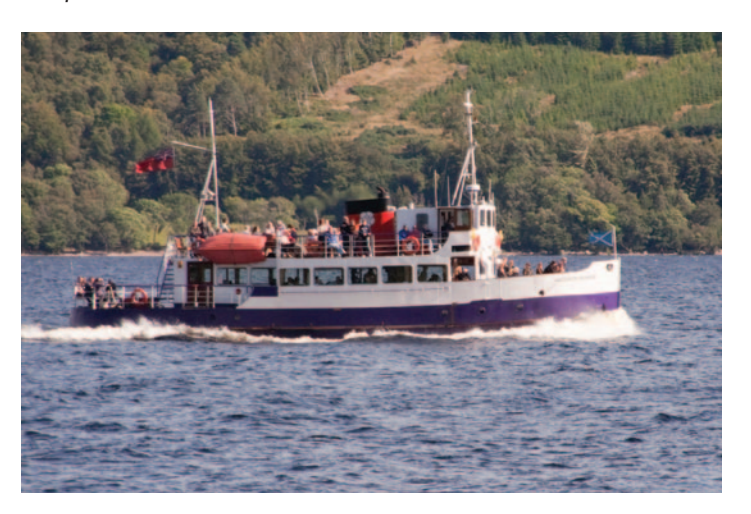
Jacobite Queen butting along Loch Ness near the Change House.