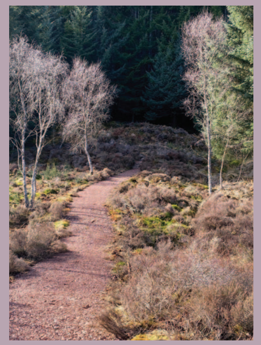
Path improvement between Foyers and Inverfarigaig