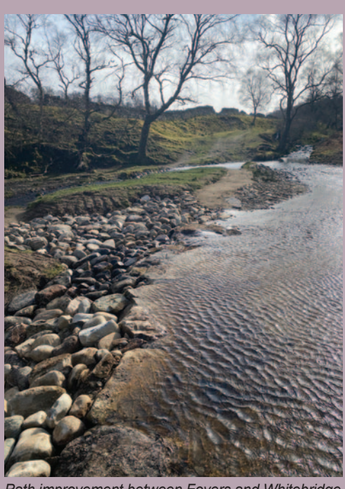
Path improvement between Foyers and Whitebridge