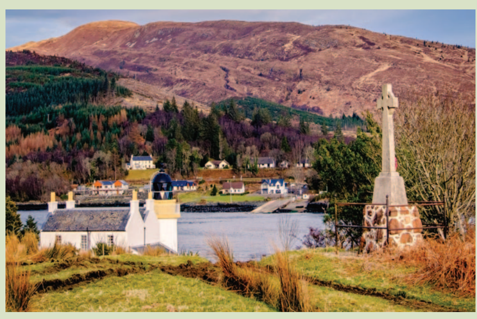
West Highlands peninsulas including Morven

Sustainable development is at the core of the organisation's work making use of community land and assets; advancing