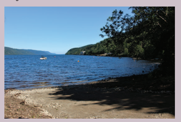
Foyers Bay Slipway