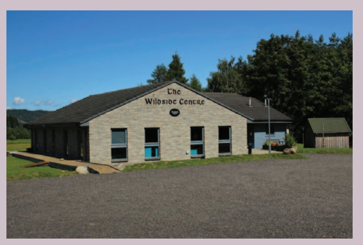
The Wildside Centre