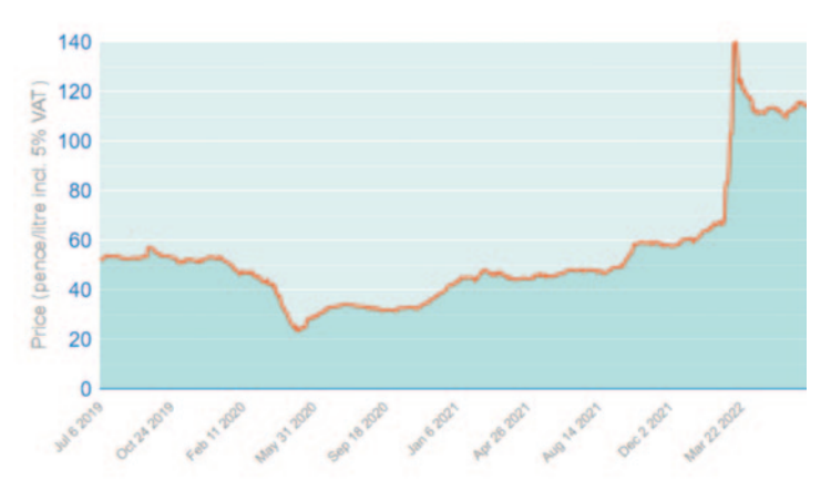
Average Home Heating Oil Price, Scotland over the last 3 years. Source Boilerjuice.com

Johnston Oils | Heating Oil Clubs | Save on cost and carbon | (johnston-oils.co.uk)